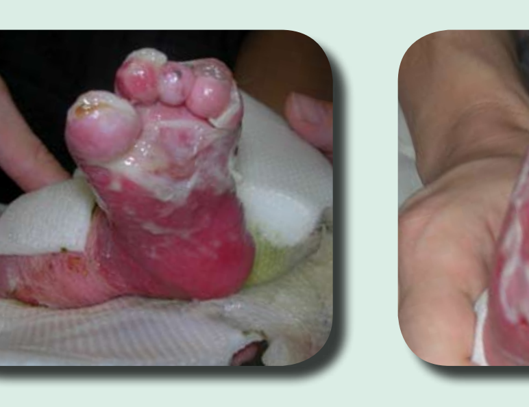
6 November 2009

Baby H was born by caesarian section. She had deep sloughy wounds on both hands and both feet. Her diagnosis was later shown to be Non-Herlitz Junctional EB. Lack of Collagen XVII results in delayed and poor healing for those affected with this type of EB.